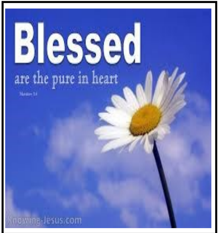
Every Blessing for a wonderful half term.